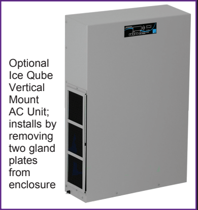
Optional Ice Qube Vertical Mount AC Unit; installs by removing two gland plates from enclosure

Note: Each ice Qube AC Unit is UL Listed and has a digital temperature controller with alarm, built in condensate evaporator, and contains CFC-free refrigerant. Ice Qube AC Units are warranted by Ice Qube for a period of 1 year from invoice date.