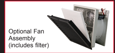
Optional Fan Assembly (includes filter)