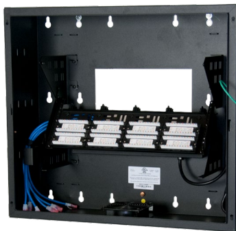
Tilt-out brackets positioned downward