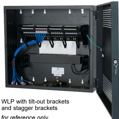
WLP with tilt-out brackets and stagger brackets

Patch panel and powerstrip shown for reference only.